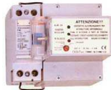
Differenziale autorichiedente bipolare.