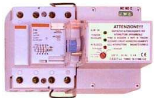
Differenziale autorichiedente tetrapolare.

L'interruttore differenziale con sistema autorichiedente ARBT-4xx effettua automaticamente la richiusura a seguito di un intervento o scatto dell'interruttore.